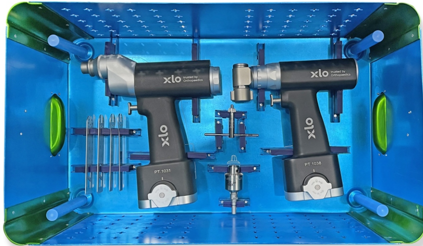
PT.0001 : XL-Multifunctional Power Tool